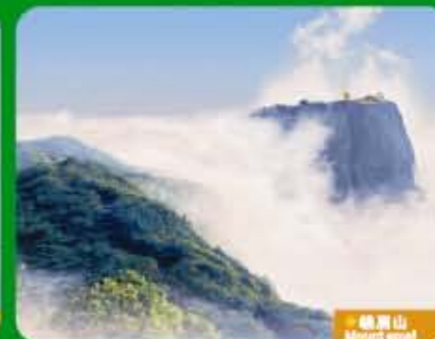
峨眉山 Mount esai