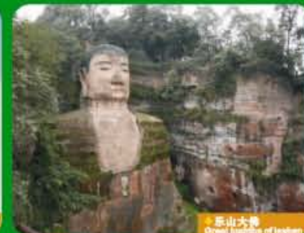
乐山大佛 Great Buddha of Leshan