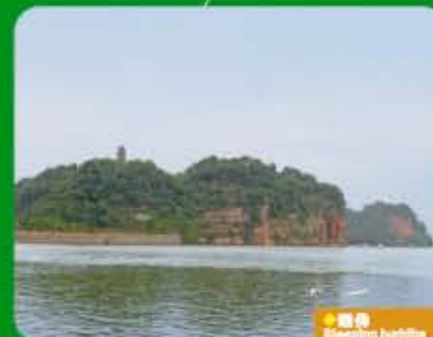
睡佛 Sleeping Buddha